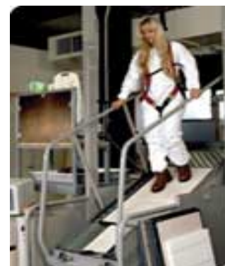
DIN ramp test

There is also some concern over the ‘R’ rating system as there is a misconception that the ‘R’ scale runs from R1 to R13 where R1 is most slippery. In reality the scale runs from R9 to R13.